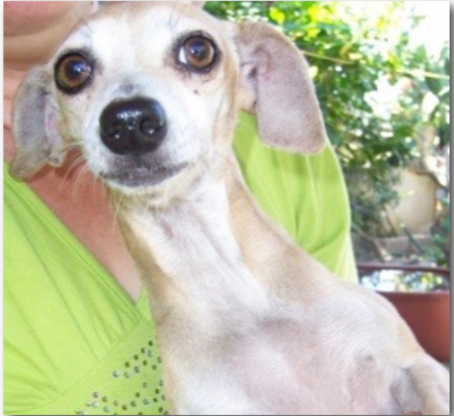
Mini, 2 year old female, and very friendly.