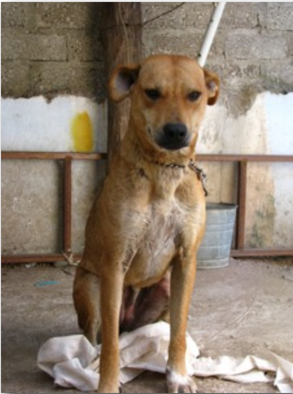
Beya, beige, 3 to 4 years old. Loves other dogs but not men! Was beaten.