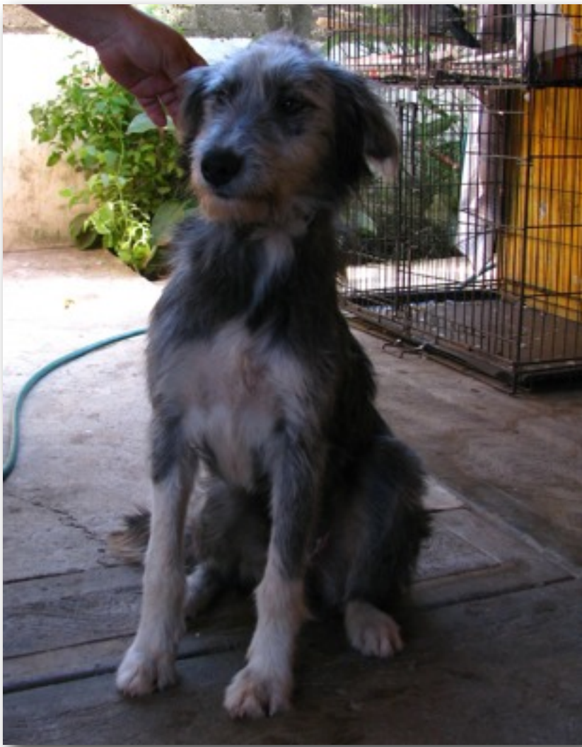
Fiona - Spayed grey and white wire haired Schnauzer cross. Female. Housebroken, very friendly!! Approximately 1 year old. Good personality and loves people. Spayed