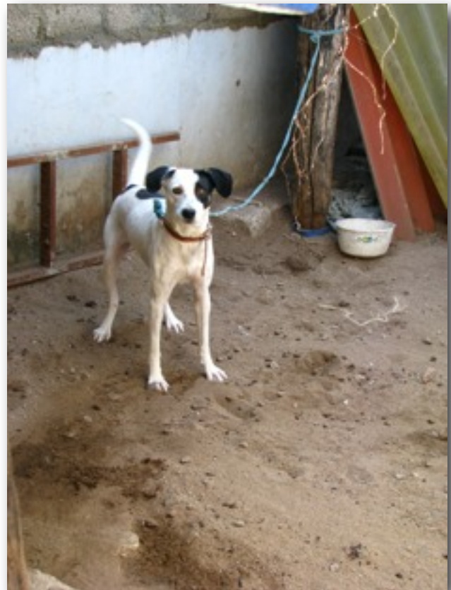
Pinta, female, black and white, friendly.