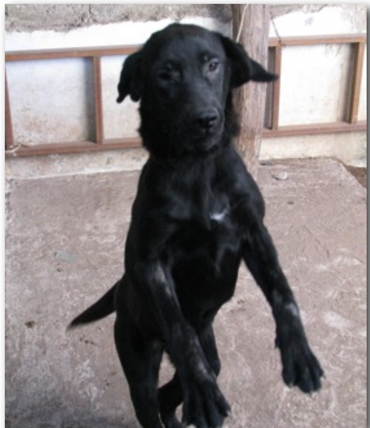
Negra - female Labrador mix, not sterilized. She is very loving and should have lots of exercise to wear off some of her exuberance!