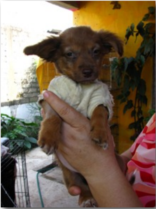
Cinnamon, long hair, male puppy 3 months old. Neutered