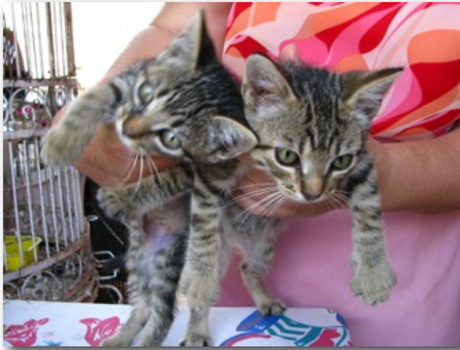
Two tabby, grey and white kittens, 4 months old.